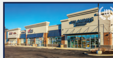
New Retail 63 100% Occupied