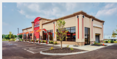
Four Seasons Car Wash