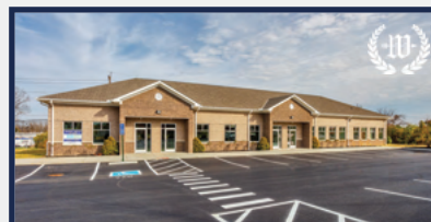
New Office, 50% occupied 2,000 SF available