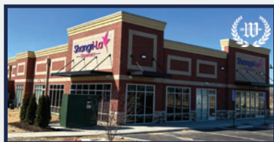
(2) New Shangri-La Dispensaries