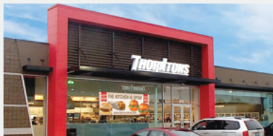
New Thorntons Gas Station