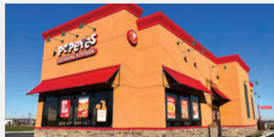
Popeyes Freestanding Location