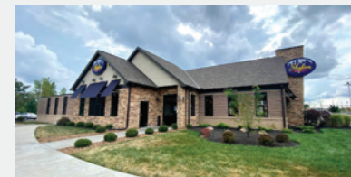
Skyline Chili - 2020